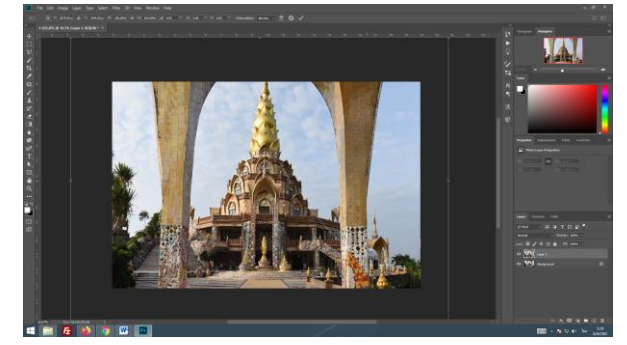
Figure 4 : Post-processing with packaged software.