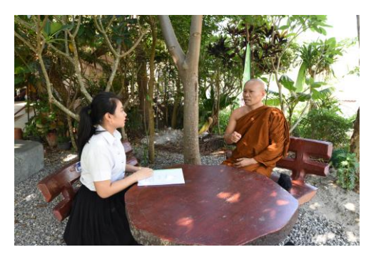
Figure 1 : Interviews with Assistant Abbot Wat Phra That Pha Son Kaew.

5. Coordinate with the staff who support Wat Phra That Pha Son Kaew to plan the photography work to record each day when there is proper light and not disturb the meditators. So the working time is between 16.00-18.00.