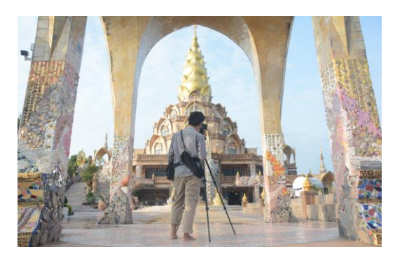
Figure 2 : To shoot the scene on site. 6. Design the layout of the photo books, including the front cover, back cover, and the content to plan illustrations both vertically and horizontally. The experts in the design of print media assess the suitability, an example has shown in Figure 3.

5. Coordinate with the staff who support Wat Phra That Pha Son Kaew to plan the photography work to record each day when there is proper light and not disturb the meditators. So the working time is between 16.00-18.00.