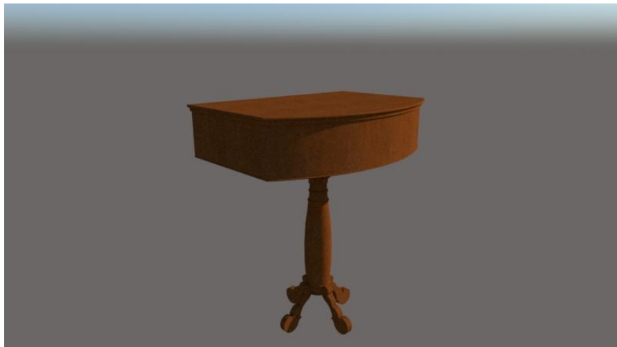
Figure 6. Student work