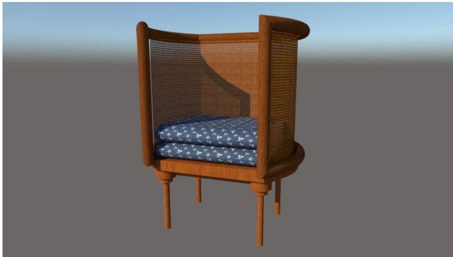
Figure 5. Student work