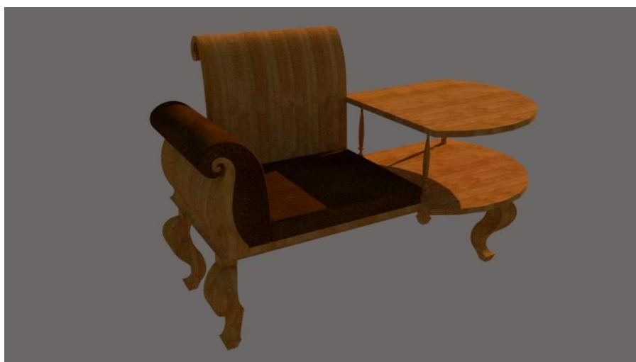
Figure 7. Student work