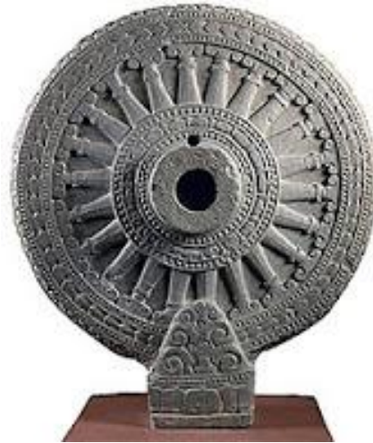
Figure 1. The Wheel of life (Dharmacaka) found at Nakhon Pathom, Thailand.