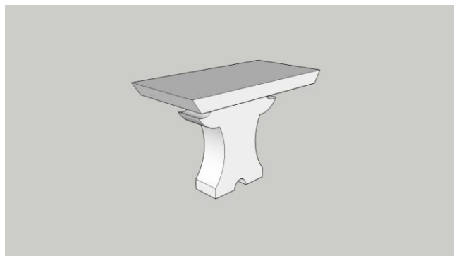
Figure 4. Student work

Examples of 2nd year undergraduate students The study of furniture design for the masses.